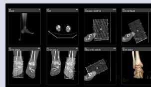
Series View Mode

Shows all the series within the study. Click on a series to display the images within that series in Image View Mode.