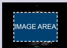
Image Area Controls

Double-click the Help Icon to turn on/off pop-up help that automatically shows available features where ever you hover the cursor.