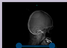
RULER AT BOTTOM